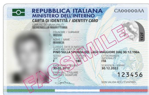
Municipal ID Card