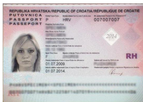
Example of passport bio data page