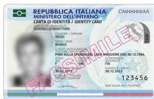
Municipal ID Card for Milano

Upon arrival in Milano, if you intend to stay for more than 90 days, you must register with the Anagrafe of the City of Milan to obtain a Certificate of Temporary Residence (“Certificato di Dimora Temporanea”) 10 . Alternatively, you might also apply as permanent resident, obtaining a Certificate of Residence (“Certificato di Residenza”) and a Municipal ID Card .