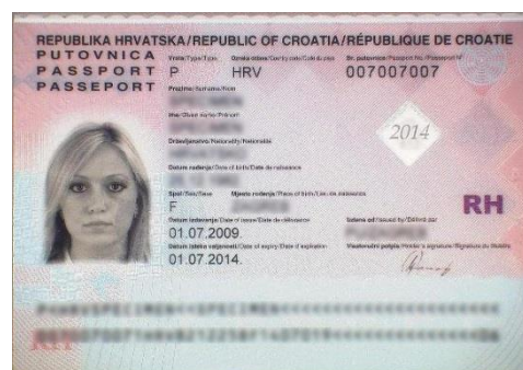
Example of passport bio data page